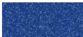
BF G740A BLUE GLITTER