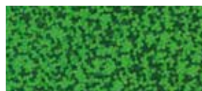
BF L750A GREEN GLAM